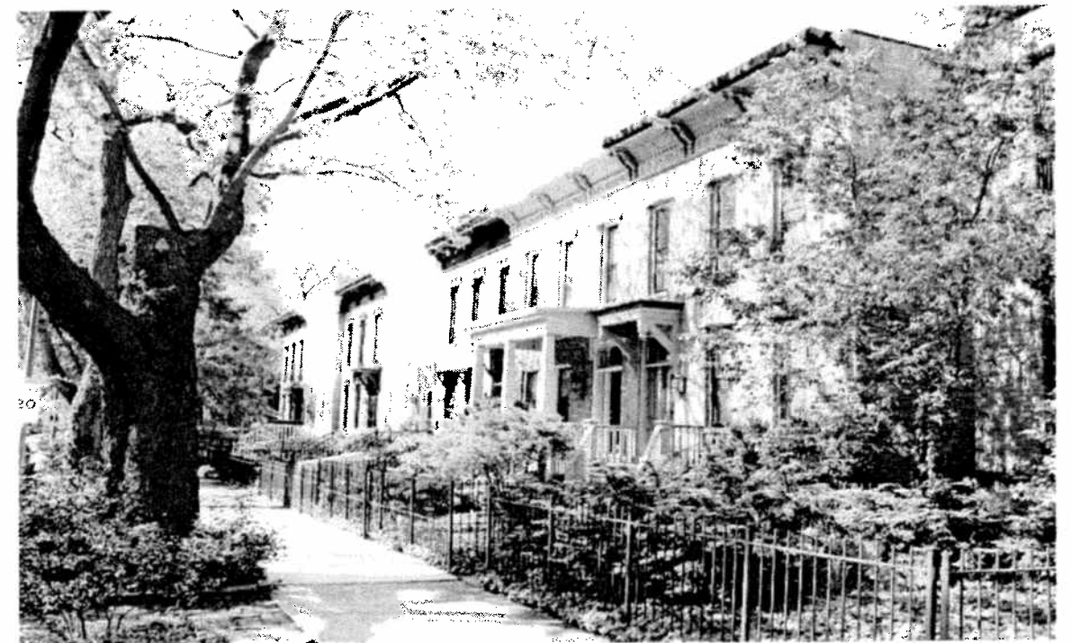
The district looking south from 2114 N. Fremont St.